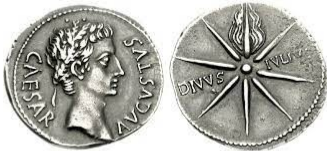
Illustration 1: Roman Denarius, 19-18 B.C.

So Caesar (the king of the Roman empire, which at that time had political control over Israel) had a right to the tax money because it had his image on it; and we are made in the image of God. Being made in the image of God, we should therefore surrender our lives to Him.